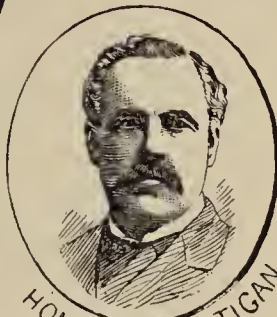
HON JOHN COSTIGAN.